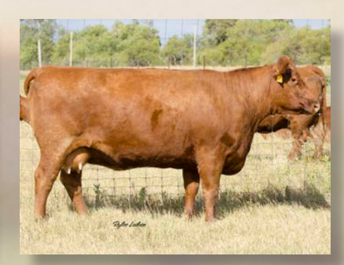
Daughters of these donors sell!